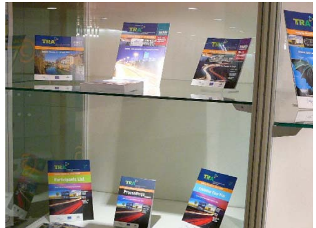
Exhibition of prints and handouts for TRA 2008