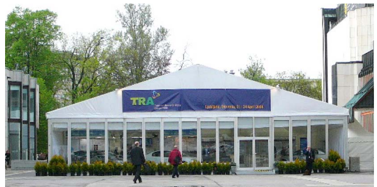
Entrance to TRA 2008 in Ljubljana

There were 207 active participants at the conference, i.e. chairmen and/or speakers.