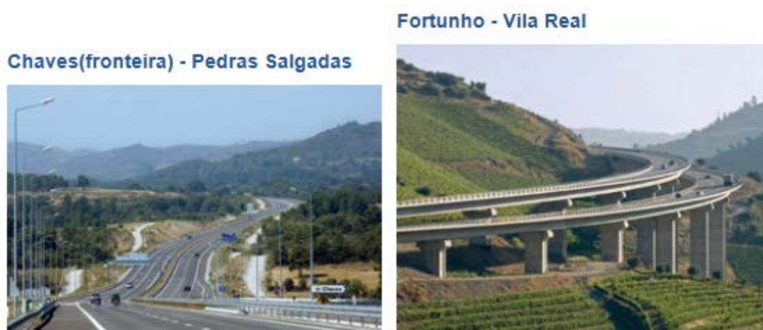
Figure 1.1. A24 motorway in Portugal. Right: stretch between Chaves and Pedras Salgadas (A24 motorway); Left: stretch between Fortunho and Vila Real.