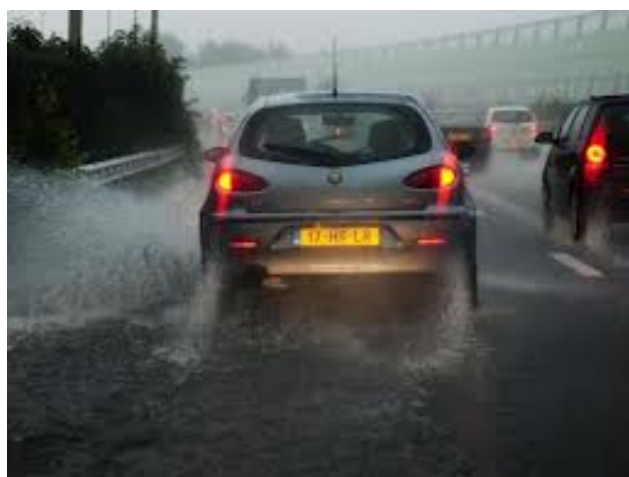
Figure 3.2 September 10, 2005: Heinenoordtunnel closed due to heavy rainfall (Source: http://www.trouw.nl/tr/nl/4324/Nieuws/article/detail/1549309/2005/09/10/Heinenoordtunnel-dicht-na-regenval.dhtml ; http://www.ed.nl/regio/helmond/dunanttunnel-dicht-door-regenbuien-1.2112074 )